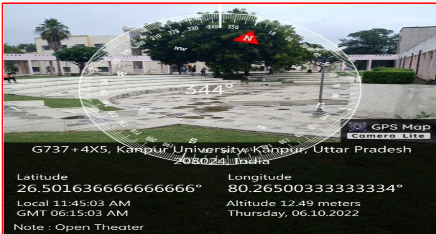
Open Air Theatre