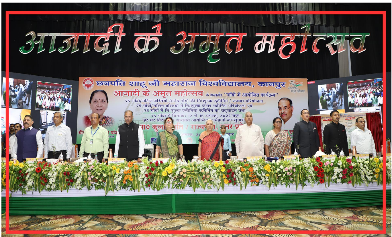
Function at University Auditorium