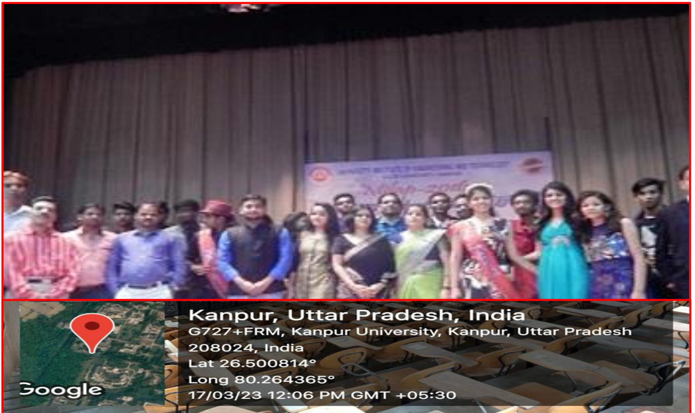
Mini Auditorium in UIET