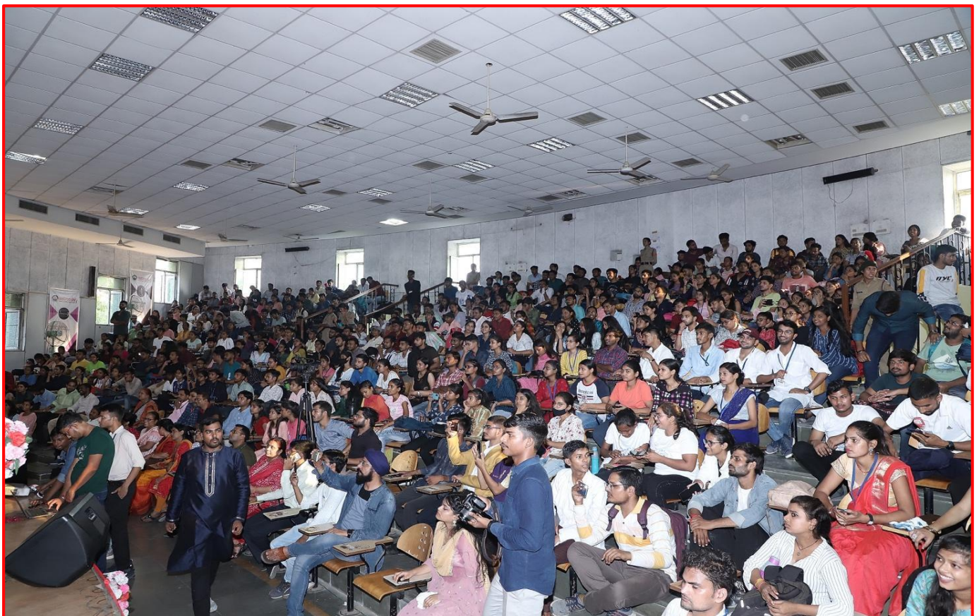
Mini Auditorium in UIET